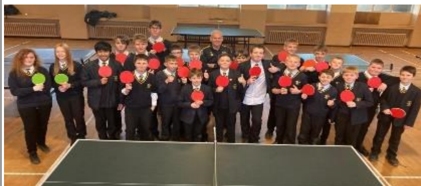
Table Tennis Club