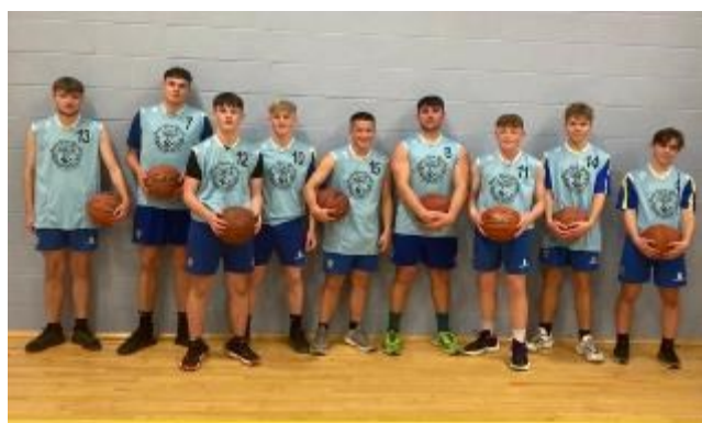
U16s Basketball Team

KS3 PE - This term the boys have worked hard developing their skills in football, rugby union, basketball and table tennis. They have been assessed against our new 'Head, Heart, Hands' criteria which not only focuses on sporting ability but also the sporting values such as respect and teamwork that pupils demonstrate. It also assesses pupils knowledge of rules, tactics and strategies in the sports we cover.