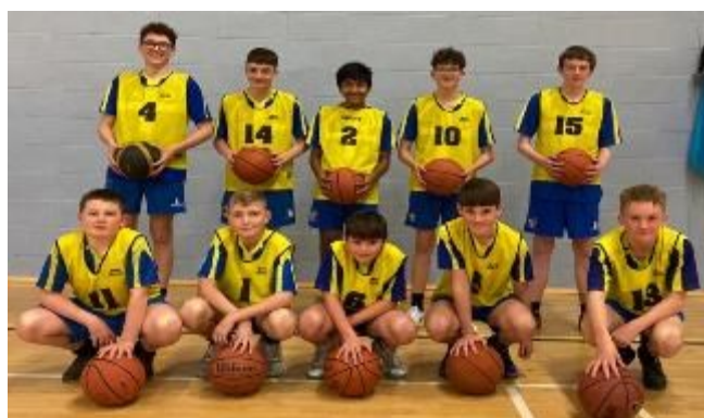
U14s Basketball Team